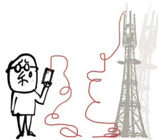
Illustration: Serge Bloch