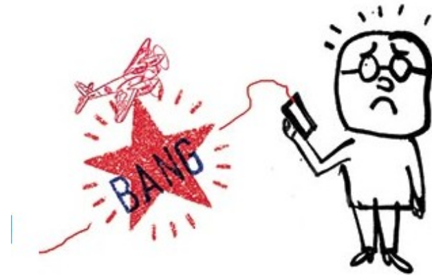
Illustration: Serge Bloch