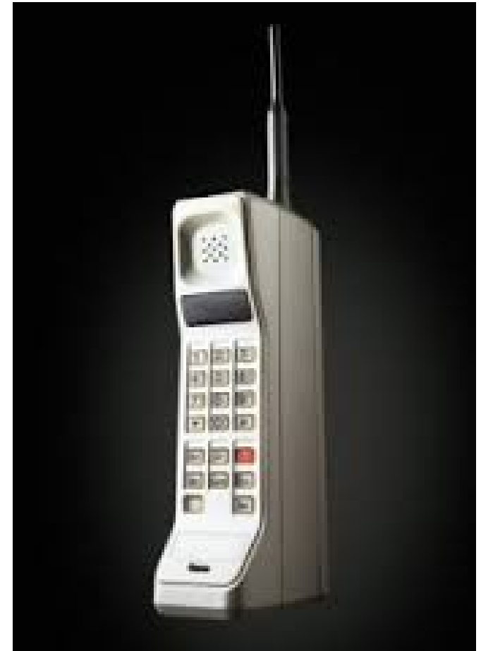
Old “brick” mobile phone