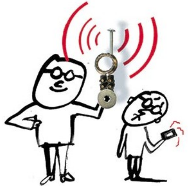
Illustration: Serge Bloch